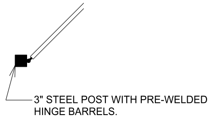
IN - SWING GATE (TYP)

USE EXIST. ROUND OR SQUARE POST OR POST PROVIDED BY GATECRAFTERS