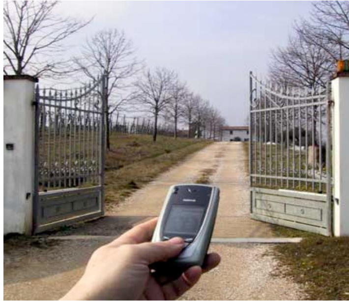
Electronic KIT to convert your gate into a GSM gate